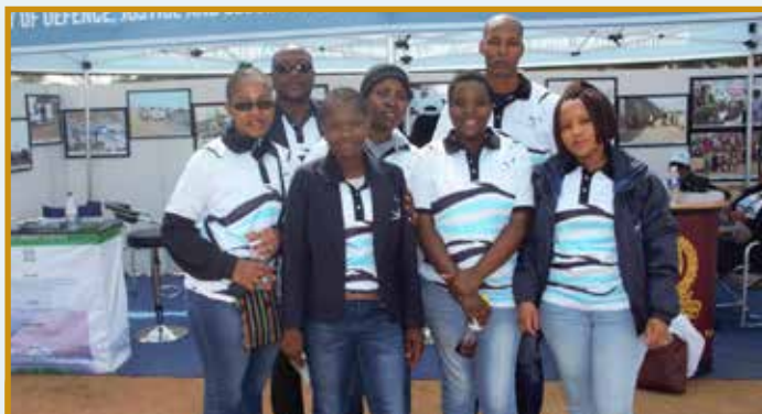
AOJ staff show-casing their services at the Ghanzi Agricultural show

The Public Sector commemorated Public Service Day on the 14th July under the theme; '50years of Service to the; Nation; United and proud'. All government departments celebrated this day with various activities such as sports, beauty pageant, choral music competitions and many more. Prior to the big day on the 13th of July different department also showcased their goods and services to the public. The Ministry of Justice Defence and Security (MDJS) exhibited. Attorney General Chambers, Administration of Justice , Legal Aid Botswana, Botswana Police Service, Botswana Prisons Service and Botswana Defence Force showcased the best innovations in line with the ministry; theme; 'Safety First, United and Proud. MDJS showcased their history their history using its different department (AGC, AoJ, Legal Aid, Police and Prisons) in an interesting pictorial format which depicts the revolutionary since 1966 to date.