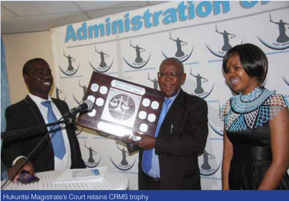
Hukuntsi Magistrate's Court retains CRMS trophy