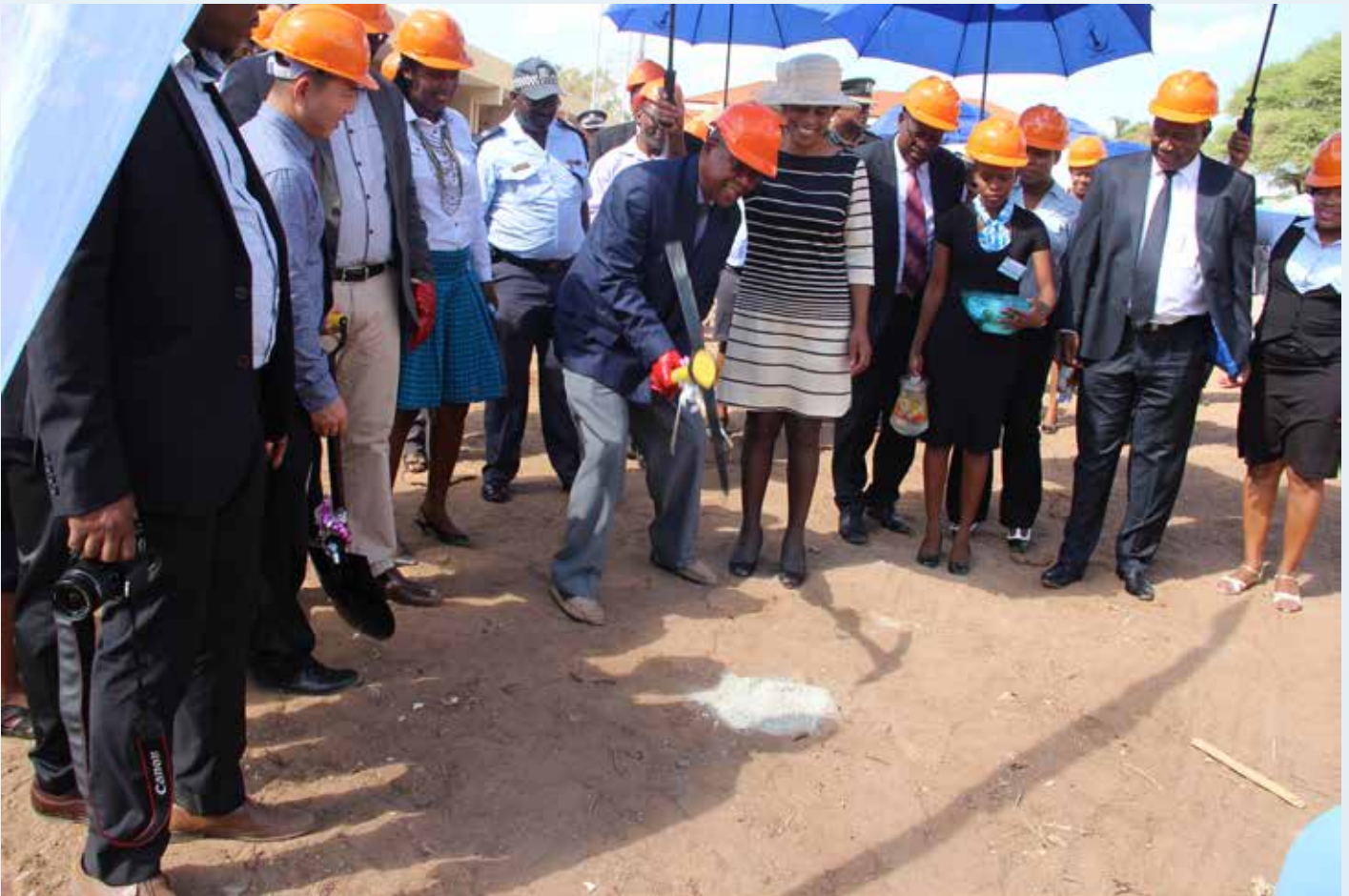
Broadhurst Magistrate's Court ground breaking ceremony