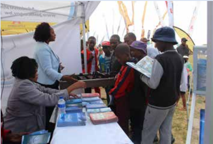
Mahalapye Magistrate's Court stall during Prisons Day in Mahalapye

AOJ exhibited in a five (5) day show, in which they received visits from the public in large numbers. The Mobile traffic court (bus) which proved to be a big crowd puller at the event.