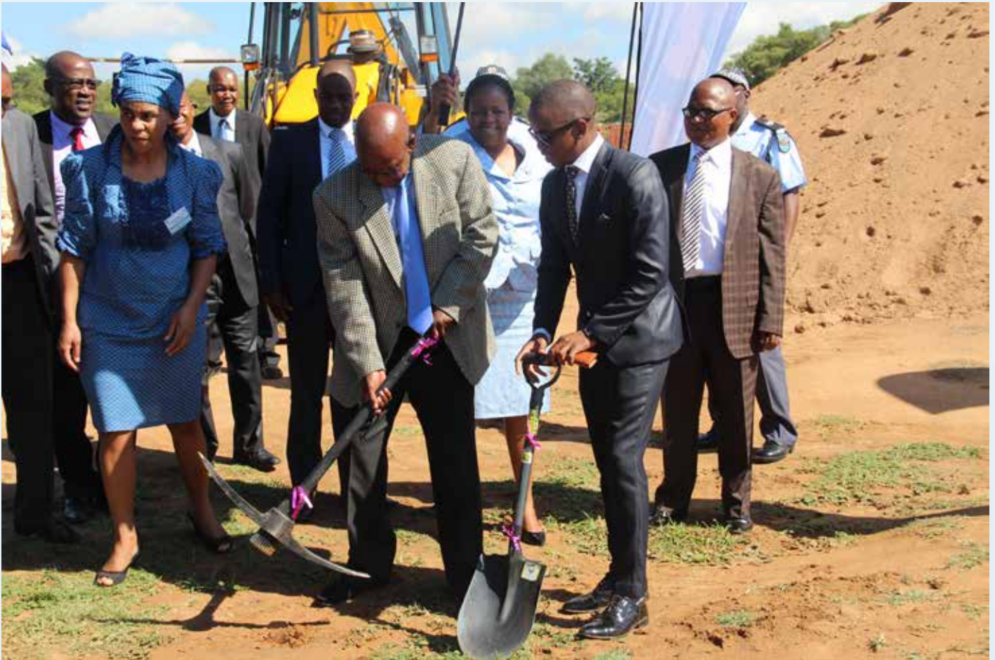
Hon Chief Justice breaking the ground to officially mark the construction of Kanye Magistrate's Court