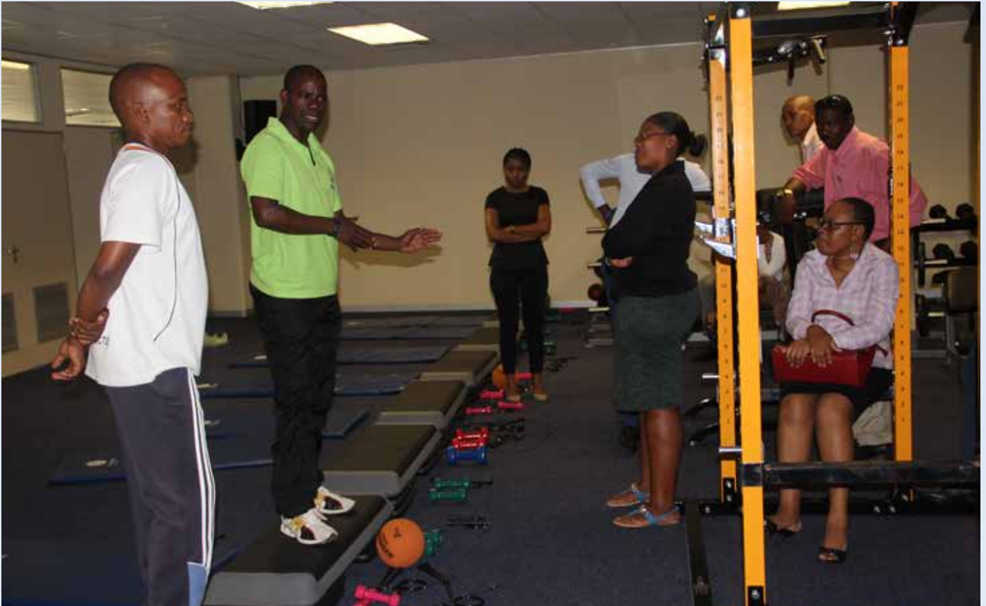
Administration of Justice GYM assistants inducted by the BDF officials