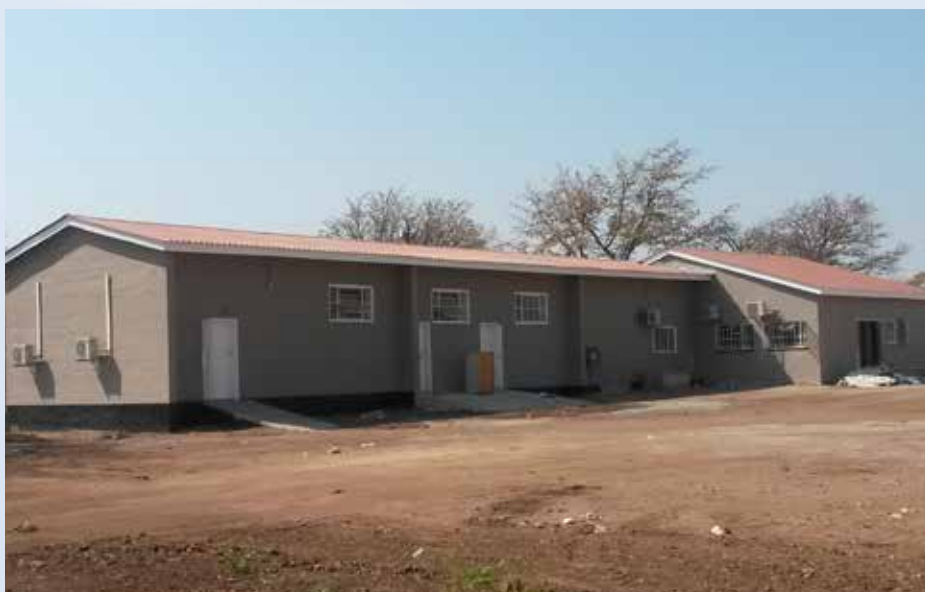
New home for Kasane Magistrate's Court staff