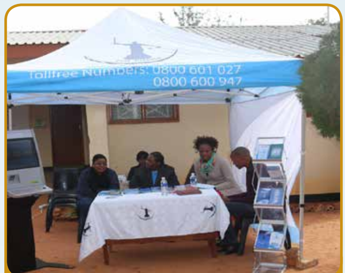
Lobatse High Court officers exhibiting at Lobatse Woodhall Customary Court