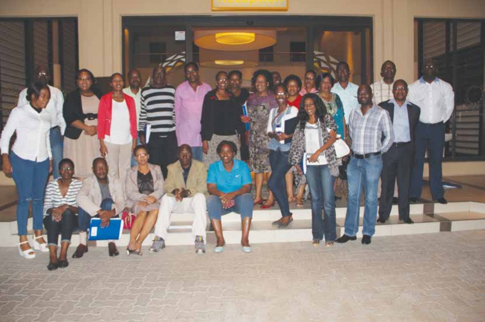
Retreat Participant in Mahalapye