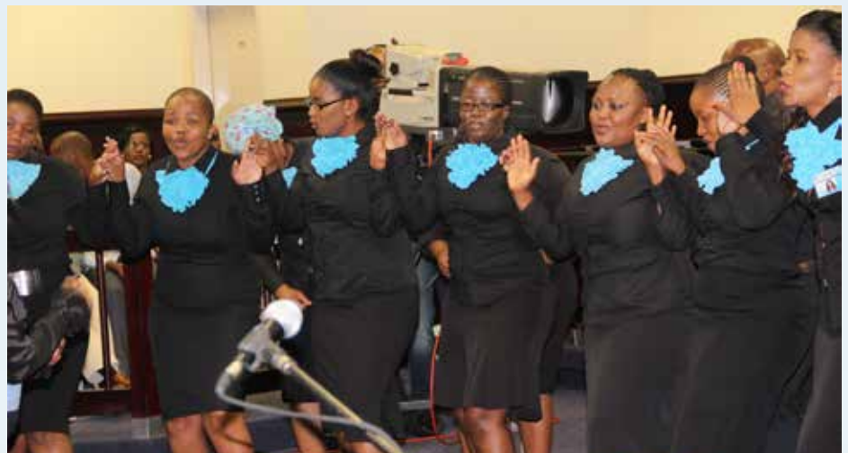
AOJ lightning the day with a nice melody on the Official Opening of The Legal Year 2016