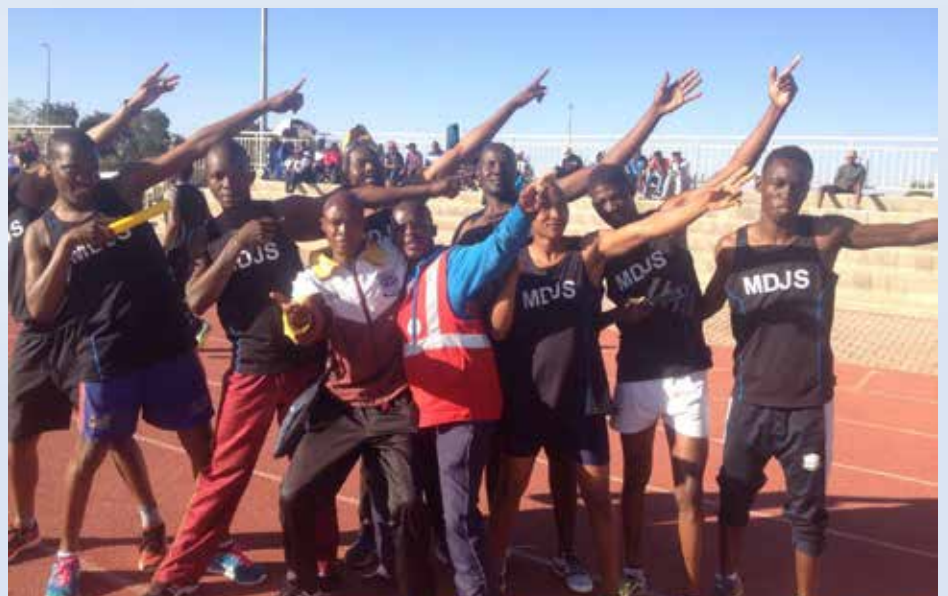
Participants posing for a photo " We made it"

In netball, AOJ the team played two games and won both of them. Whereas the 3rd one was not played because the ministry of Trade and Industry did not have netball team thus earned them soft points. The team scored 28-8 against MLH and won 28-11 against MTI. The Results were nullified as the Ministry of Agriculture walloped AOJ with 15-35 not qualifying for the next round.