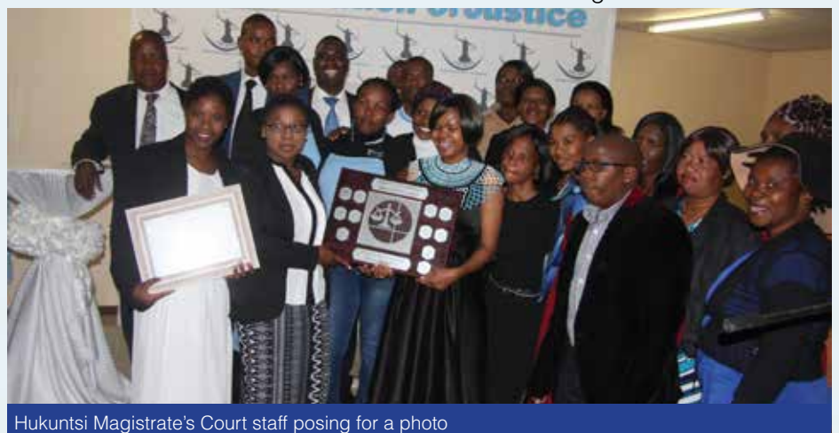
Hukuntsi Magistrate's Court staff posing for a photo