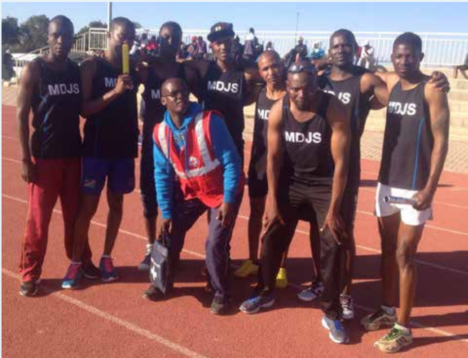
Ministry of Defence, Justice and Security participants for 2016 Public Service Day