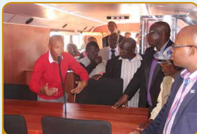
Officer from Palapye Magistrates Court explaining to the customers on the purpose of the Mobile Traffic Court