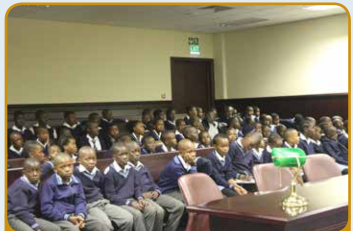
One of the Schools at Court 5 during an educational tour recently in Gaborone High court