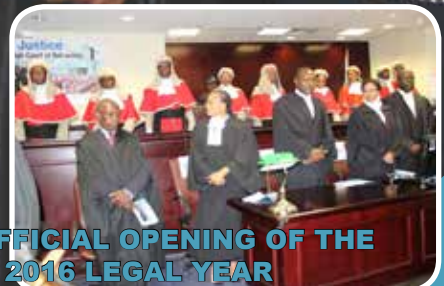
THE OFFICIAL OPENING OF THE 2016 LEGAL YEAR