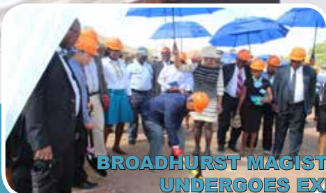
BROADHURST MAGISTRATE'S COURT UNDERGOES EXPANSION