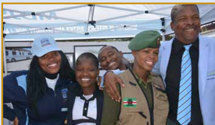
Ministry of Defence, Justice and Security exhibitors posing for a photo.