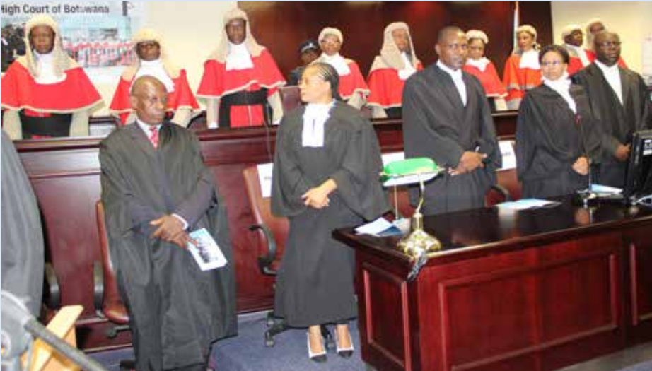
Hon. Judges and Registrars of the High Court honouring the national anthem at the Official Opening of the Legal Year 2016