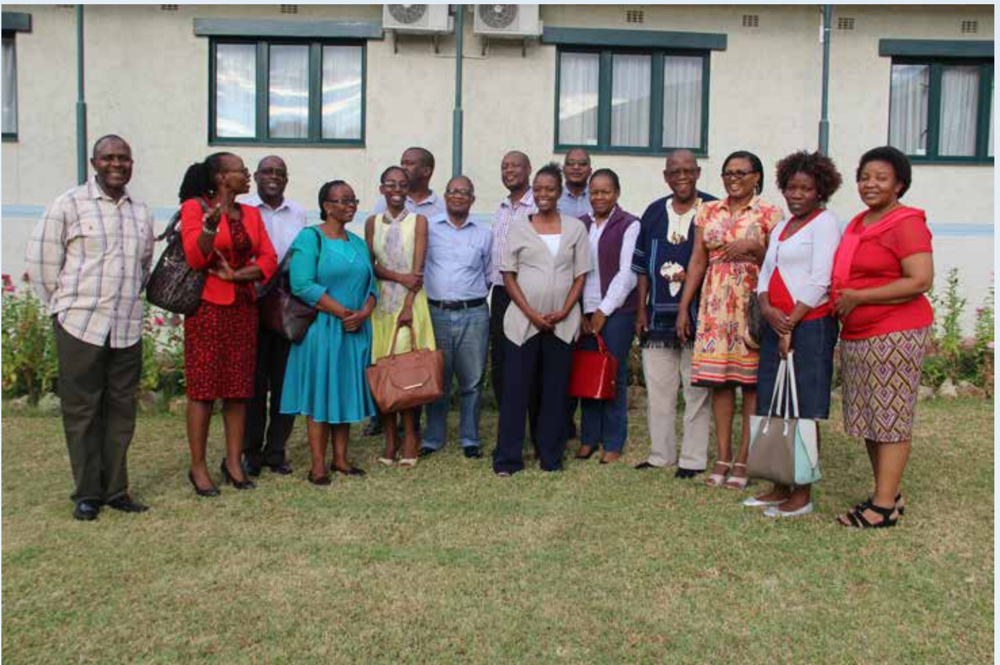
Retreat Participants in Maun

Summing up the retreat the Hon. Chief Justice highlighted the need to reflect on the successes and challenges in order to emerge, revitalize and reinvigorate with a clear way in terms of supervision and leading by example. 'As talk is cheap the cliché goes, iron sharpens another iron, so it must with all of us, he said.