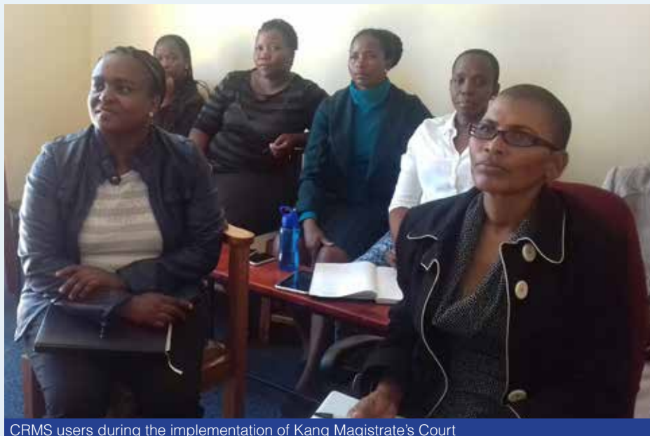
CRMS users during the implementation of Kang Magistrate's Court