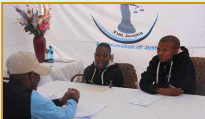
Ghanzi Magistrate's Court staff attending to a client during the show.